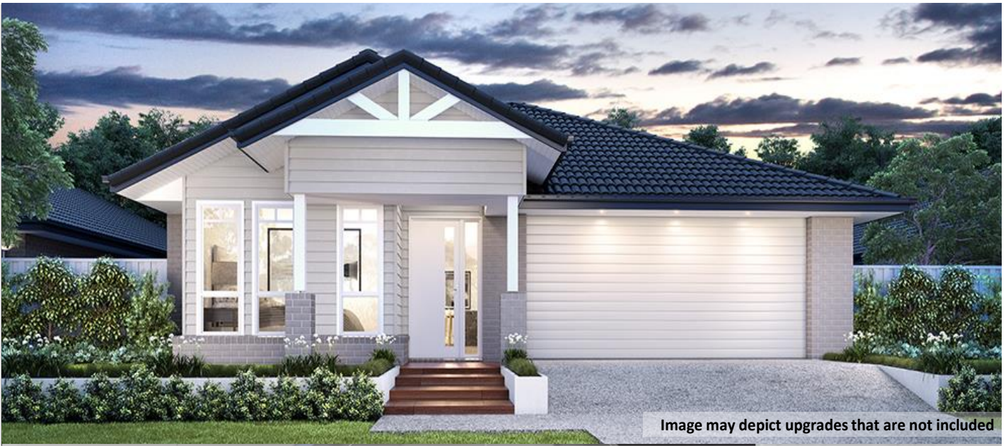
Image may depict upgrades that are not included

Floor area: 250.74m 2 / 26.99sq | Block Size: 603.1m 2 Address: Lot 111 Moonee Beach Estate, Moonee Beach