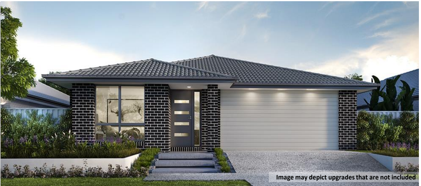
Image may depict upgrades that are not included

Floor area: 186.39m 2 / 20.06sq | Block Size: 679m 2 Address: Lot 66 Moonee Beach Estate, Moonee Beach